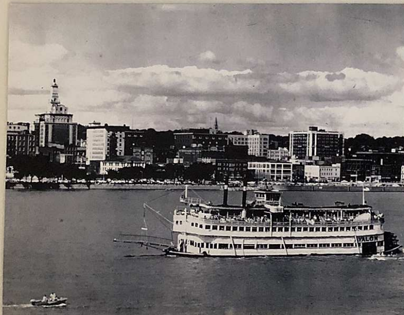
LEFT: AVALON with excursion party passing Davenport, IA, 1950's.